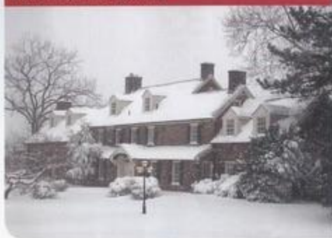
Snow at Pearl S. Buck House

The home of Pearl S. Buck was up next. An amazing humanitarian, tireless champion for children of mixed race and the first woman to receive both the Pulitzer and Nobel prizes for literature, Ms. Buck's award-winning gardens and farmhouse are a day well spent. What a thrill to see the desk where she penned "The Good Earth," along with original furnishings, paintings from renowned artists, and intriguing photos of luminaries like president John F. Kennedy and Eleanor Roosevelt to name a few. www.pearlsbuck.org