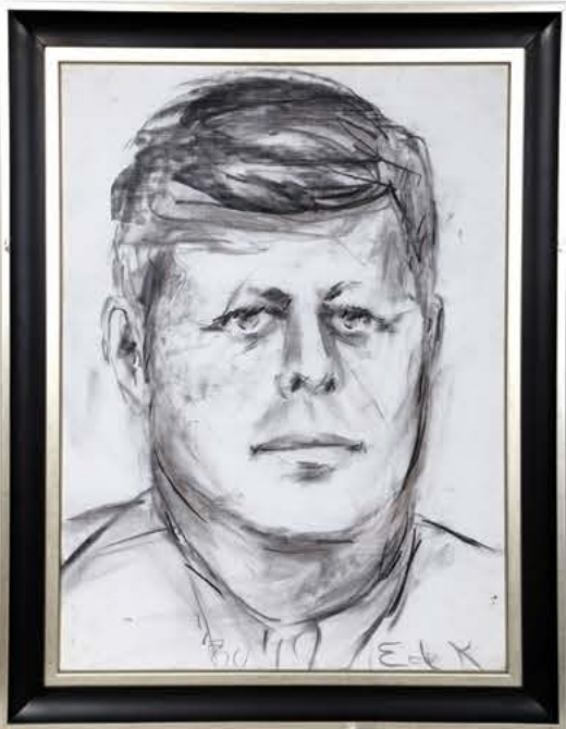
ELAINE DE KOONING JFK No. 10 Painting $50,000 fine art buyers seeking consignments for future sales 800-888-1063 or 718-937-0901 art@rogallery.com

Monthly Art Auctions - World-Wide Shipping & Framing The Greatest Selection of Art on the Internet!