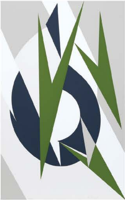
LEE KRASNER Embrace Silkscreen $2500

5000+ modern & contemporary artists PAINTINGS PRINTS PHOTOS SCULPTURES